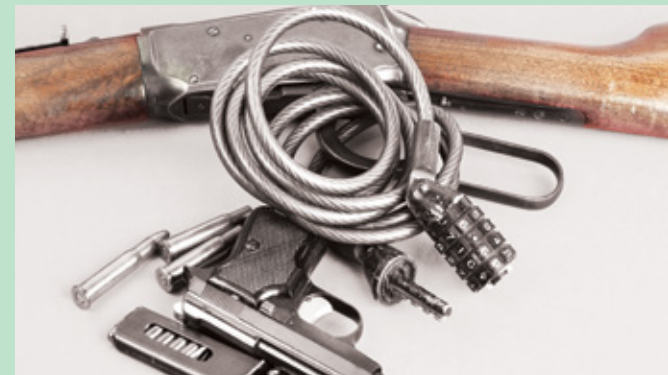
Cable locks and gun safes are recommended for everyone who owns guns.

On one hand, the rules for safe gun use seem pretty straightforward and hardly worth repeating. Treat all guns as though they are loaded, watch where you point, store them safely.