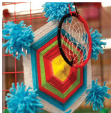
The dream catcher is a woven web believed to protect the dream world of the person who sleeps beneath it

Enjoy stories and light snacks from noon to 1 p.m., then from 1 to 3 p.m. children can learn how to weave a dream catcher to take home. The dream catcher is a woven web believed to protect the dream world of the person who sleeps beneath it. The cost for the dream catcher kit is $5 and includes materials and instructions. Please allow an hour to make the craft. This project is recommended for children ages 8 and up. Cost for the kit does not include admission to museum.