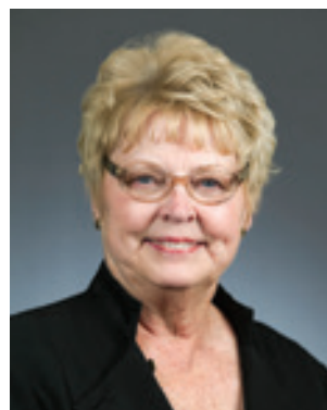
Rep. Sondra Erickson

The protest reads in part: "Representatives Pugh and Lohmer posted inflammatory material after members of the Muslim American community conducted a training on how citizens could participate in the political process in the state of Minnesota. Their comments generated fear and mistrust about political participation by members of a religion different from their own. This violates the House Code of Conduct with respect to fostering public participation in democracy. The anti-Muslim rhetoric on Facebook in Minnesota prior to precinct caucuses resulted in threats of violence against Muslim Americans. Representatives Pugh and Lohmer should not have used the words 'penetrate' and 'infiltrate' regarding a group of citizens participating in Minnesota's political caucuses — whether those citizens were Muslim, Jewish, Hindu, Buddhist, or Christian. Citizens of all faiths are guaranteed religious liberty by the First Amendment to the U.S. Constitution and the Bill of Rights in Article 1, Sections 16 and 17 of the Minnesota Constitution."