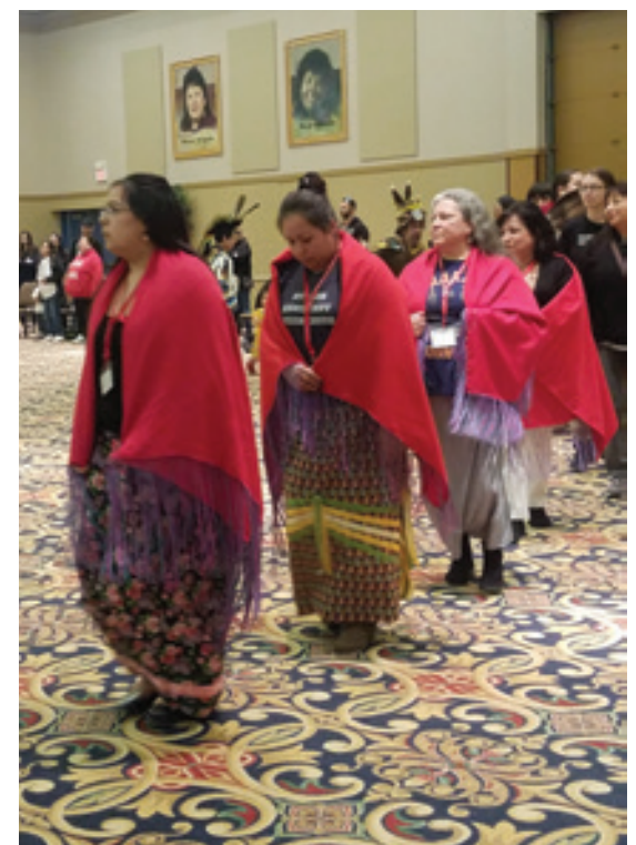
On April 4-6, the FVPP worked with the Minnesota Indian Women's Sexual Assault Coalition and other sponsors to host the 12th Annual Restoring the Sacred Trails of Our Grandmothers: Pathways to Ending Gender-Based Violence. The event included a traditional powwow on April 5.

If you are having an issue with domestic violence, sexual abuse, or Elder abuse, call the toll-free 24-hour crisis line at 866-867-4006.