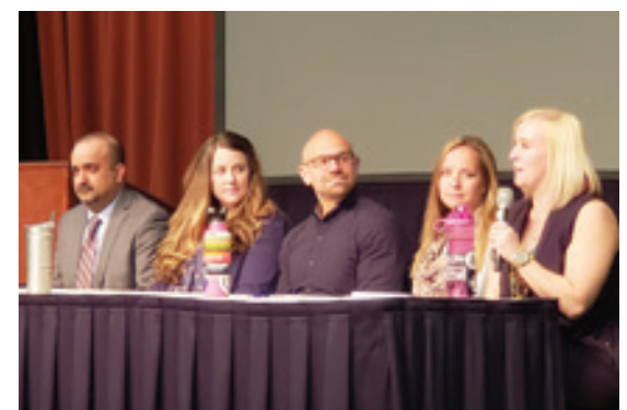
The Family Violence Prevention Program hosted a Human Trafficking Summit on April 23.