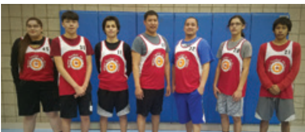
Top: Ojichidaag (left) and Go Bananas (right). Bottom: Smudge Walkers (left) and Toon Squad (right).