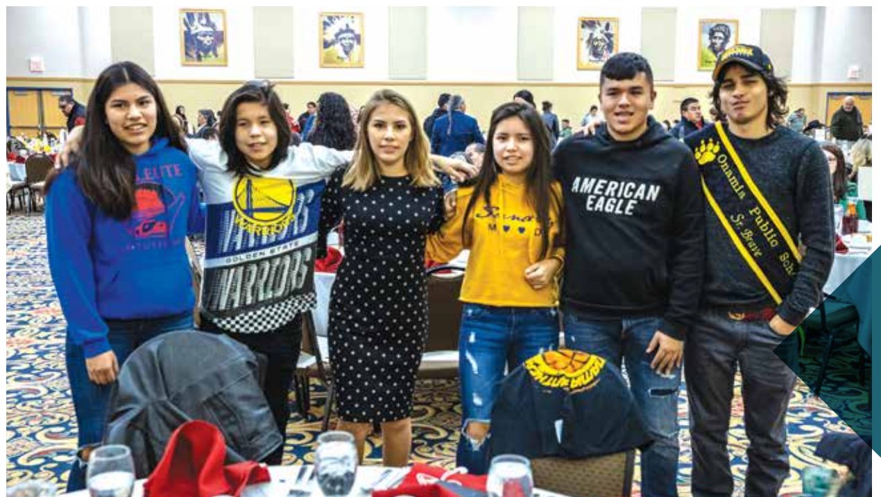
Onamia High School students were among the attendees at the 2019 State of the Band Address.

To do this, they need more information about your concerns, and have requested the government's help in getting that feedback.