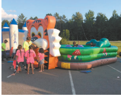
Food, games, and inflatables are all free at National Night Out.

National Night Out is an annual community-building campaign that promotes police-community partnerships and neighborhood camaraderie. This is a drug- and alcohol-free event.