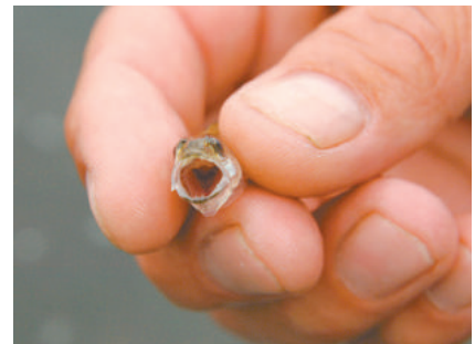
More than a million ogaa (walleye) fry have been stocked in rearing ponds this year.