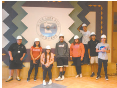
Students are learning about team-building, presentations, and communication at Mille Lacs Corporate Ventures this summer.

The internship will wrap up with each summer intern giving a final presentation as part of their teams to share what they have learned and applied throughout the workshop. All the presentations will happen on Tuesday, August 6. More information about these students will be shared in future issues of Ojibwe Inaajimowin .