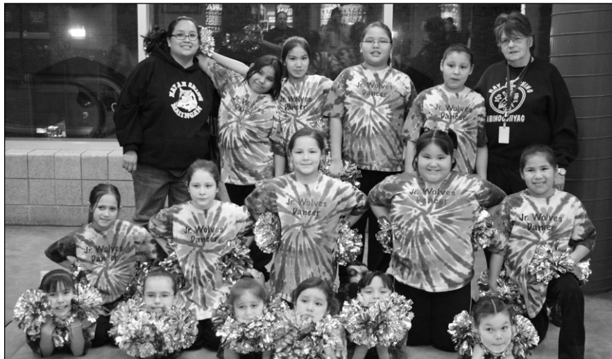
Nay Ah Shing cheerleaders perform a halftime routine with the Timberwolves Dance Team at the February 11 game.